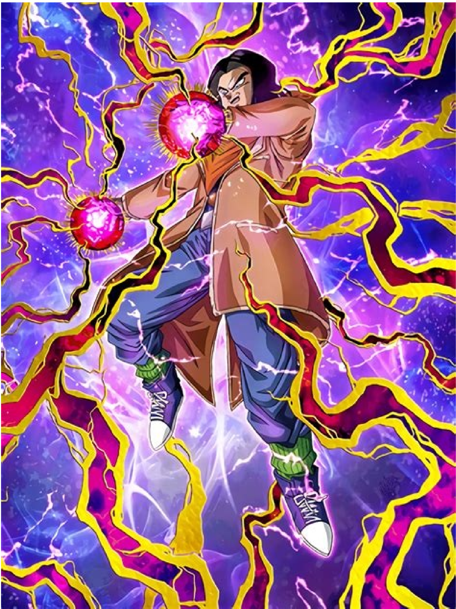
Lr android 16 17 18 hidden potential. Android 17 and 18 lr hidden potential.